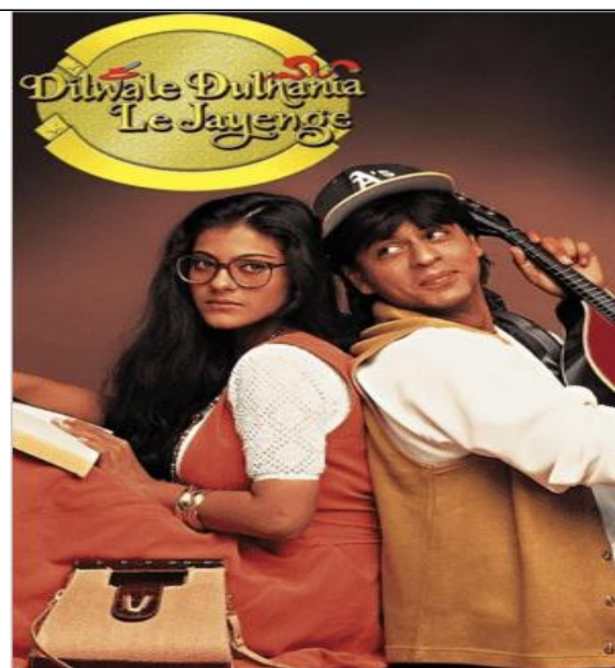
Fig 2: Kajol in Dilwale Dulhania Le Jayenge. (1995) juxtaposes Western attire with the sari, symbolizing constrained modernity and negotiation of female agency within familial structures

The decade of the 1990s marked a turning point in the Indian film industry, coinciding with India’s economic liberalization in 1991. Liberalization introduced globalization, the entry of multinational corporations, satellite television, and the expansion of consumerist culture. Bollywood became a crucial site where these socio-economic transformations were reflected and popularized. Cinema, always a mirror of societal aspirations, began to embody the fantasies of a rising middle class. Within this framework, the representation of women in Hindi cinema underwent significant changes, though these changes often