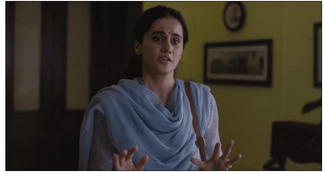
Fig 8: Taapsee Pannu in Thappad (2020) refusing domestic violence, exemplifying moral and emotional agency within patriarchal familial frameworks.

A landmark example is Anubhav Sinha’s Thappad (2020), which sparked national debate by questioning the normalization of domestic violence within marital relationships. The film, centering on a seemingly “minor” incident of a slap, critiques how Indian society trivializes women’s suffering and insists on their unconditional endurance for the sake of familial harmony. Thappad transcends its immediate narrative by positioning the protagonist’s refusal to “adjust” as a symbolic rejection of deeply embedded patriarchal expectations. Scholars of feminist film theory might read this as a cinematic enactment of everyday resistance, where the smallest acts of refusal destabilize hegemonic power.