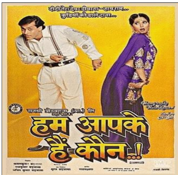
Fig 1: Madhuri Dixit in Hum Aapke Hain Koun (1994), representing traditional femininity combined with cinematic glamour, reflecting the era’s reinforcement of patriarchal norms