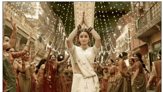
Fig 9: Alia Bhatt in Gangubai Kathiawadi (2022), transforming victimhood into power, challenging social hierarchies and gendered oppression.

Similarly, Sanjay Leela Bhansali’s Gangubai Kathiawadi (2022) reclaims a stigmatized subject—the prostitute—as a figure of power and leadership. The film, based on Hussain Zaidi’s Mafia Queens of Mumbai , reconstructs the life of Gangubai as a narrative of survival, resilience, and eventual dominance within the male-dominated spaces of crime and politics. By portraying her as both victim and victor, the film embodies what Judith Butler (1990) [2] calls the paradox of agency: women exercise agency within, rather than outside, patriarchal structures, often by subverting the very norms meant to confine them.