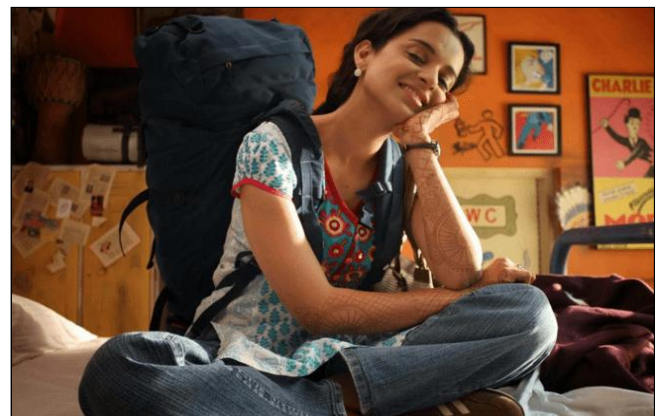
Fig 6: Kangana Ranaut in Queen (2014) as a solo traveler in Europe, symbolizing self-discovery and liberation from patriarchal constraints.

Following this, Queen (2013), starring Kangana Ranaut, resonated deeply with audiences by narrating the journey of Rani Mehra, a middle-class woman who embarks on a solo honeymoon after her fiancé calls off the wedding. The film celebrated female independence, self-discovery, and the breaking away from patriarchal expectations of marriage as the ultimate goal for women. Importantly, it showed an ordinary woman finding her voice in extraordinary circumstances, thus broadening the spectrum of "relatable" female protagonists in Bollywood.