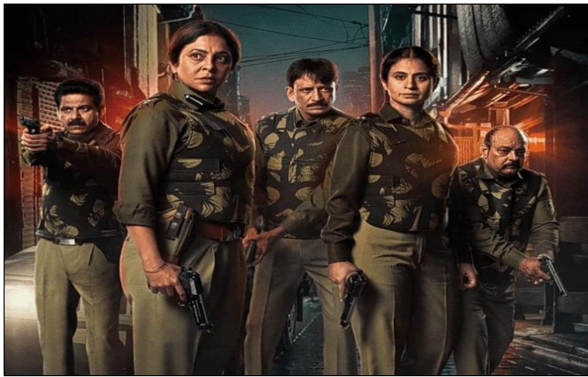
Fig 10: Female leads in Delhi Crime (OTT, 2020s) assert professional authority in public spaces, reflecting contemporary narratives of resistance and self-determination.

systemic violence and agents of justice, with the female police officer Vartika Chaturvedi (played by Shefali Shah) symbolizing empathetic yet firm law enforcement.