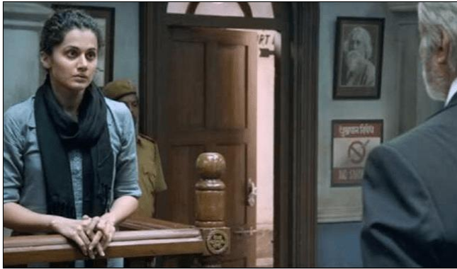
Fig 7: Taapsee Pannu in Pink (2016) courtroom scene foregrounds consent and women’s legal empowerment, emphasizing structural inequalities and resistance.

alongside Amitabh Bachchan, the film directly engaged with issues of consent and victimblaming in the context of sexual harassment. By foregrounding the slogan “No means No,” Pink dismantled entrenched notions of morality, character judgment, and women’s autonomy over their bodies. It moved beyond symbolic empowerment to confront real-life socio-legal issues, reflecting the ongoing feminist movements in Indian society and the broader global wave of gender justice debates.