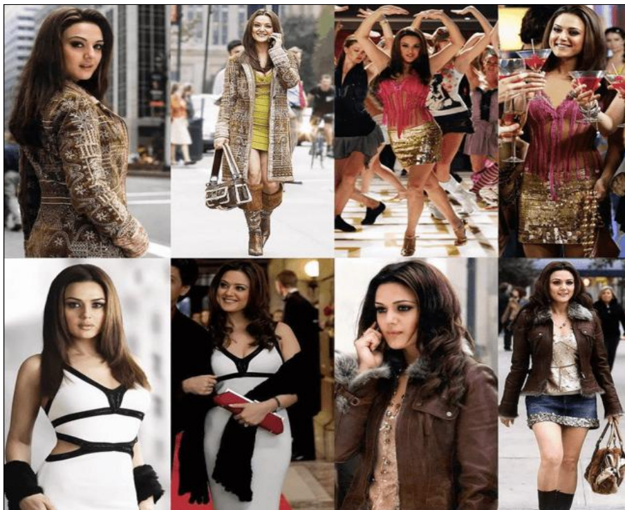
Fig 3: Preity Zinta in Kabhi Alvida Na Kehna (2006) depicting urban professional women negotiating love, autonomy, and societal expectations

The decade of the 2000s marked a significant transitional phase in the representation of women in Bollywood cinema. By this time, the forces of globalization, economic liberalization, and the rapid rise of consumer culture had begun reshaping not only the social fabric of India but also its cinematic narratives. The urban middle class, buoyed by aspirations of upward mobility and a global lifestyle, became a key demographic for Bollywood, and consequently, women's portrayals reflected the anxieties and ambitions of this newly visible social group. Films such as Kabhi Alvida Na Kehna (2006) brought conversations about women's emotional independence and