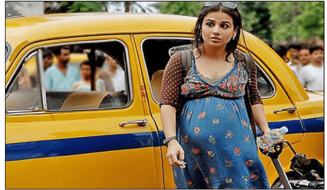
Fig 5: Vidya Balan in Kahaani (2012) navigating public spaces while pregnant, challenging gendered stereotypes and asserting female agency in urban landscapes.

Bagchi's character challenged the male-dominated thriller genre and demonstrated that women could anchor commercially successful mainstream cinema without a male superstar at the helm.